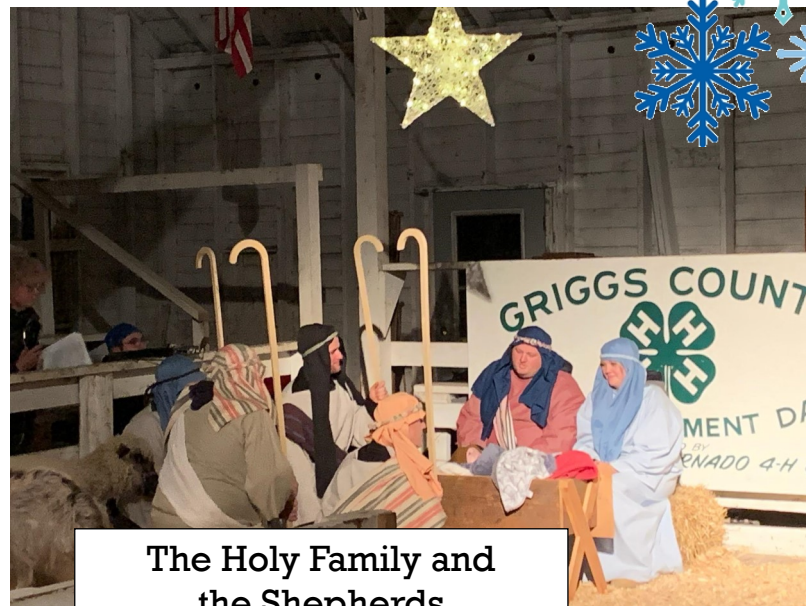
The Holy Family and the Shepherds

2019 GC MINISTERIAL LIVE NATIVITY GRIGGS COUNTY FAIR BARN